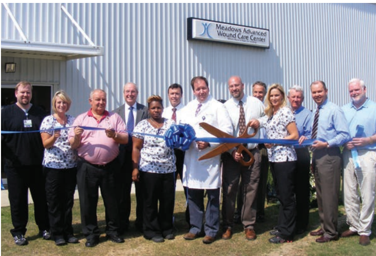
Groundbreaking ceremony for the new Meadows Advanced Wound Care Center took place on June 9, 2011.